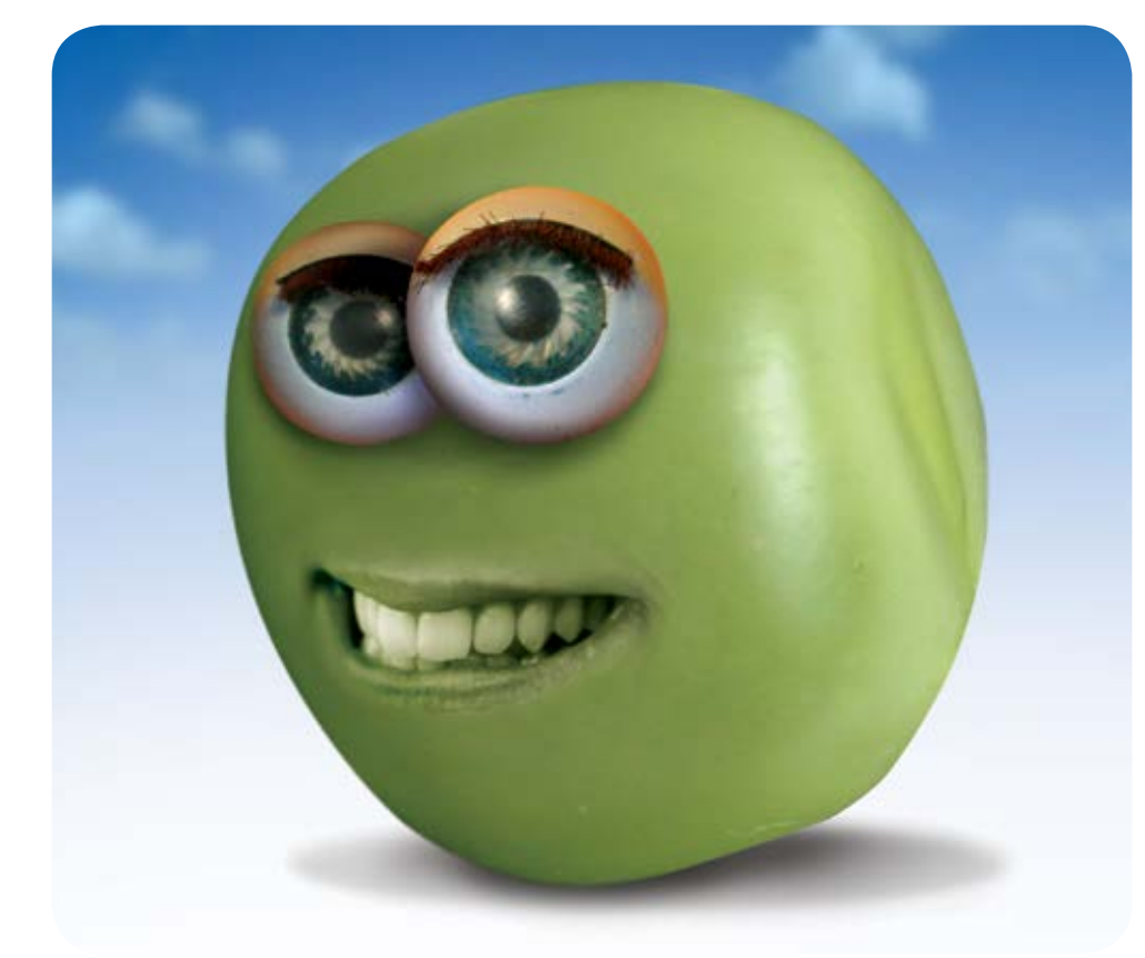
This is the little, green pea. She is very sweet.