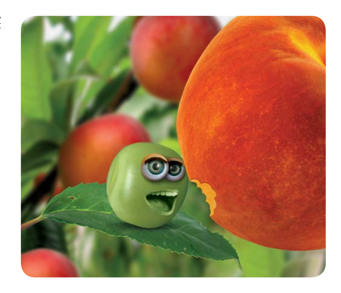
The little, green pea is sitting on a leaf.